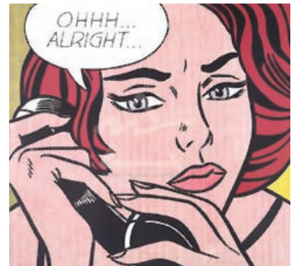
Ohhh...Alright... Roy Lichtenstein

During the 1980's and 1990's Lichtenstein was mixing and matching various different styles, often using optical tricks to draw the viewers in and to create debate. He also returned to the use of Benday dots with a new and more refined style on his earlier work. Lichtenstein's huge body of work gave him the title of one of America's greatest living artists. He died at the age of 73 in 1997.